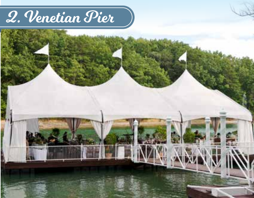
Pixel This Photography