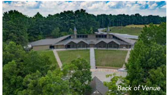
Back of Venue