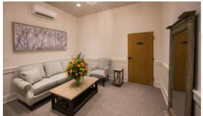
Two Bridal Holding Rooms