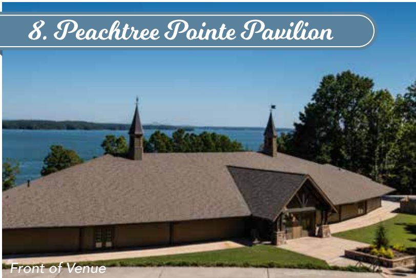
Front of Venue